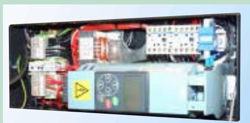
Internal view of electric cabinet with its inverter.